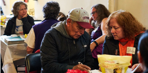
Volunteers help first-time voters understand their midterm election ballots at our Bring Your Own Ballot party.