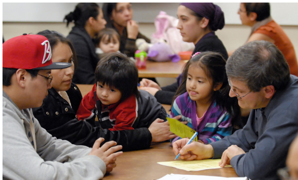
Families like this one arrive two hours before our monthly clinic opens to receive legal assistance.