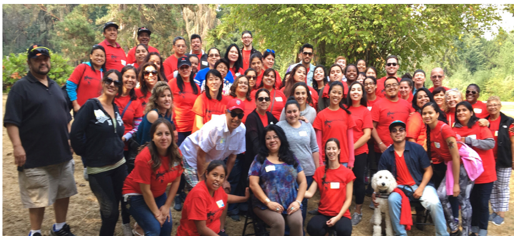
Staff and volunteers at the 2018 Pachanga (Staff Appreciation Day).

As an organization grounded in the Latino community of Washington State, it is the mission of El Centro de la Raza (The Center for People of All Races) to build the Beloved Community through unifying all racial and economic sectors; to organize, empower, and defend the basic human rights of our most vulnerable and marginalized populations; and, to bring critical consciousness, justice, dignity, and equity to all the peoples of the world.