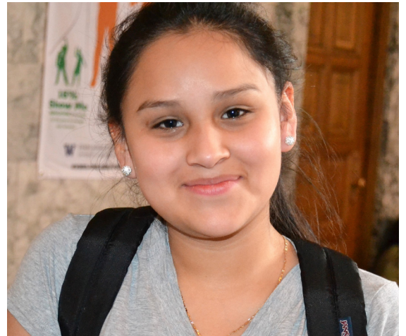
Youth attends Latino Legislative Day to speak one-on-one with elected officials.