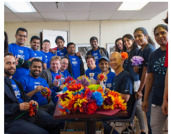
Volunteers helped prepare for the Gala on Day of Caring.

Save the date for our Building the Beloved Community Gala on October 12, 2019 at the Washington State Convention Center! Purchase tickets at www.belovedcommunitygala.org