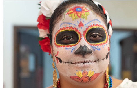
Over 1,500 people attended the opening day of our annual Día de los Muertos celebration.