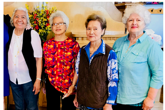
Seniors gather for a photo after working on their computer literacy.

"I volunteer regularly with my time at the Legal Clinic and at many of the events at El Centro de la Raza. My recent gift is an extension of this work and a way to express how much I love El Centro de la Raza and all you do."