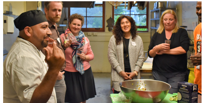
Cooking class attendees learn how to make ceviche. All proceeds support our Senior Nutrition & Wellness Program.