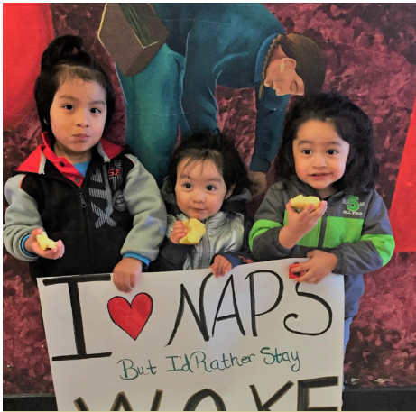
Young children learn to defend workers' rights on May Day.