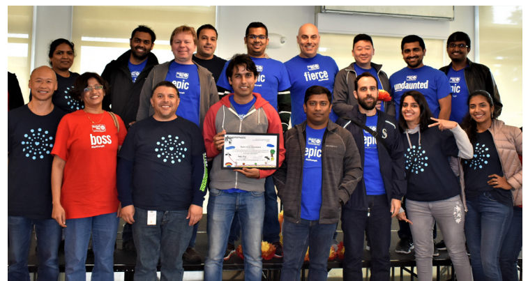
Employees from SPARC GLUE and Microsoft join us on United Way of King County's Day of Caring on September 14.

To volunteer, fill out an online application by clicking the "Volunteer Now" button at elcentrodelaraza.org , email volunteer@elcentrodelaraza.org , or call (206) 957-4602 .